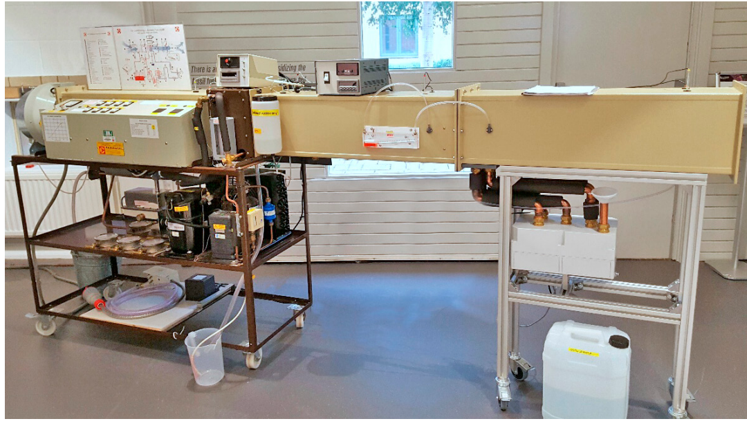
De Montfort – features additional bespoke evaporative cooling unit