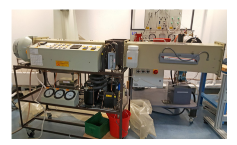
Limerick Institute of Technology – standard unit