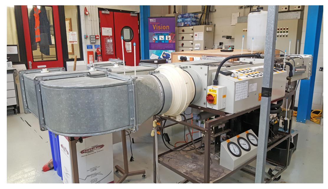
Institute of Technology Tallaght – features customer fitted recirculating duct