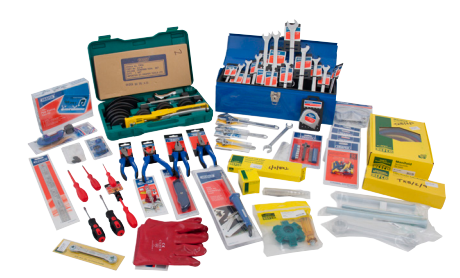
TKB Student Tool

• When initially training student in the fault finding and repair of air conditioning systems, difficulties can be experienced when evaluating a standard commercial unit. This is due to the fact that commercial systems are necessarily compact, of basic design and thermally insulated. The Hilton Model 817 with its open but fully operational format ensures that both the Trainer and the Trainee are able to study the major air conditioning parts and components on a working system and promotes a clear understanding of Air Conditioning Systems and in particular the reverse cycle operation of air conditioning systems for heating purposes.