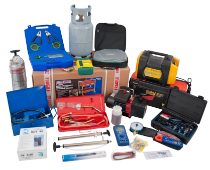
TSE Test and Service Package

*Available with optional data acquisition **Available with optional data acquisition and additionally R100 Pressure Enthalpy Software