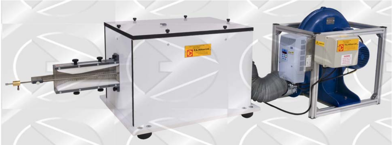
Figure 1: F100 base unit (comprising a Centrifugal Fan and a Plenum Chamber) with Optional F100B fitted