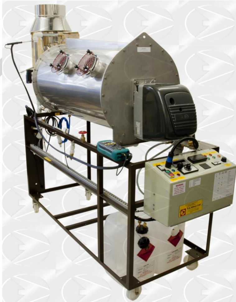
Figure 1: C492 Unit with Optional C492A fitted